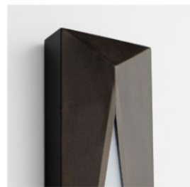
-22 Oiled Bronze