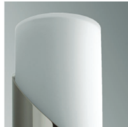
-1 White Opal Glass