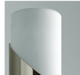
-2 Matte White Acrylic