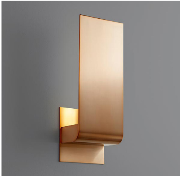
-25 Satin Copper