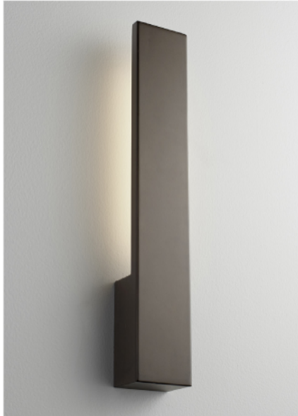
-22 Oiled Bronze

FIXTURE TYPE _____ LOCATION _____ PROJECT _____ DATE _____