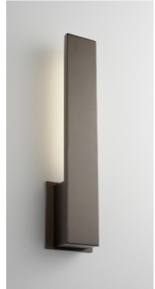
With optional backplate