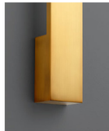
-40 Aged Brass