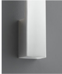
-14 Polished Chrome