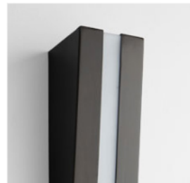
-22 Oiled Bronze