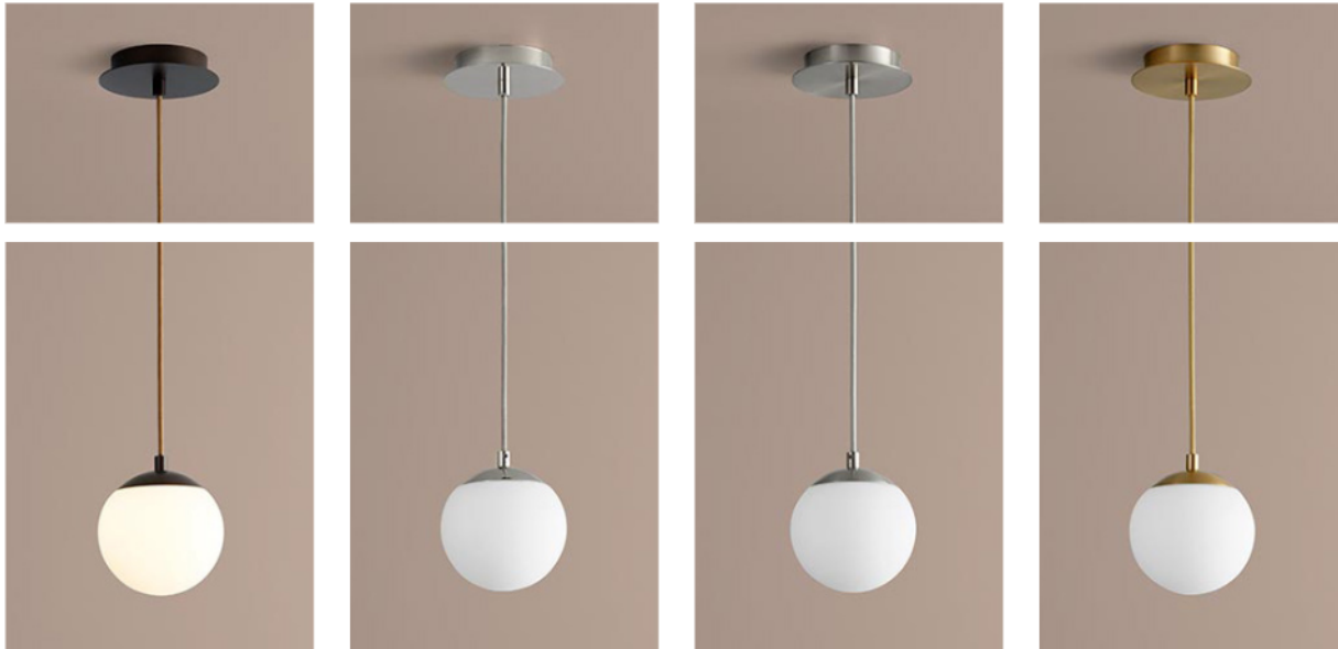
-22 Oiled Bronze -20 Polished Nickel -24 Satin Nickel -40 Aged Brass