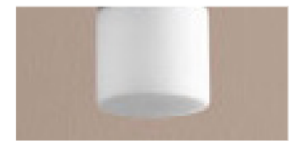
- Matte White Acrylic