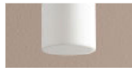
-1 White Opal Glass