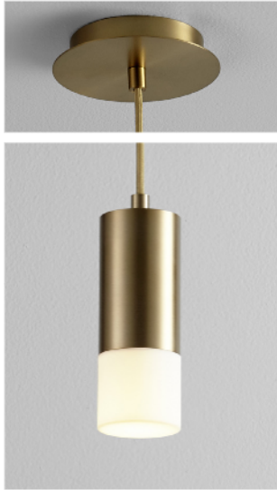
-40 Aged Brass