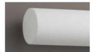
- Matte White Acrylic