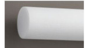
-1 White Opal Glass