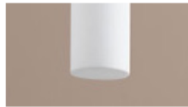
- Matte White Acrylic