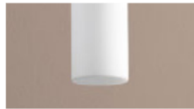
-1 White Opal Glass