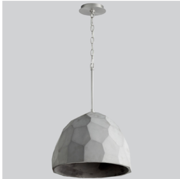
-1624 Gray/Satin Nickel