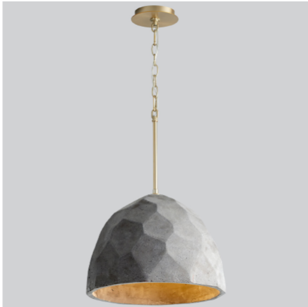
-1540 Dark Gray/Aged Brass Lit