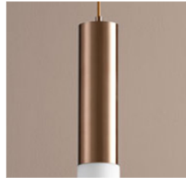
-25 Satin Copper