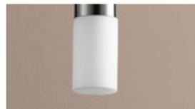
-1 White Opal Glass