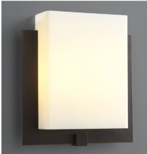
-95 Old World

FIXTURE TYPE _____ LOCATION _____ PROJECT _____ DATE _____