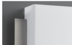
-2 Matte White Acrylic