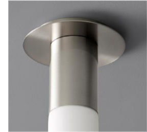
-24 Satin Nickel