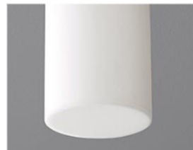
-1 White Opal Glass