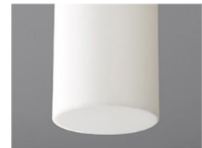
-2 Matte White Acrylic