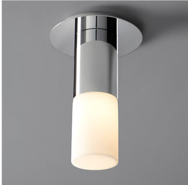
-20 Polished Nickel