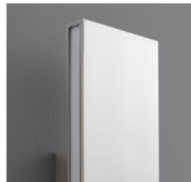
-24 Satin Nickel