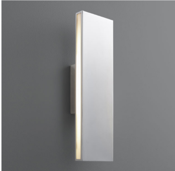
-14 Polished Chrome