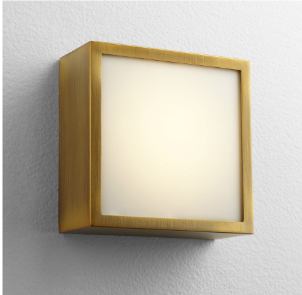
-40 Aged Brass