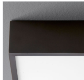
-22 Oiled Bronze