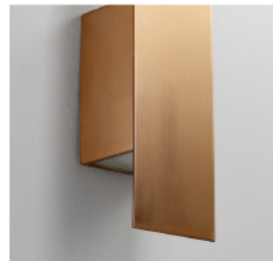
-25 Satin Copper