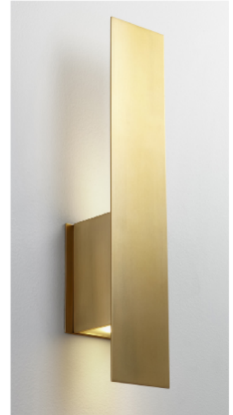
With optional backplate