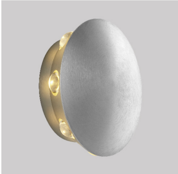
-16 Brushed Aluminum