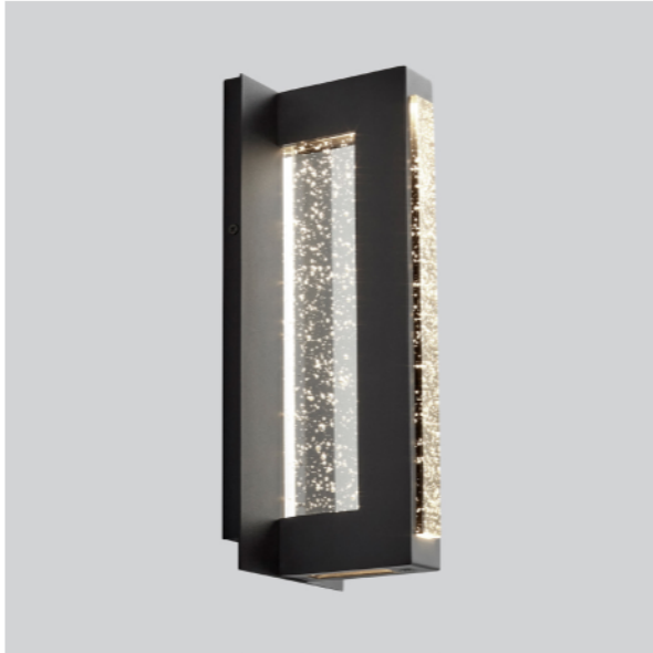
-15 Black (Lit)