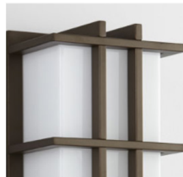
-22 Oiled Bronze