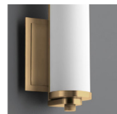
-40 Aged Brass