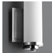
-20 Polished Nickel