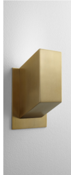
With optional backplate