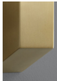
-40 Aged Brass