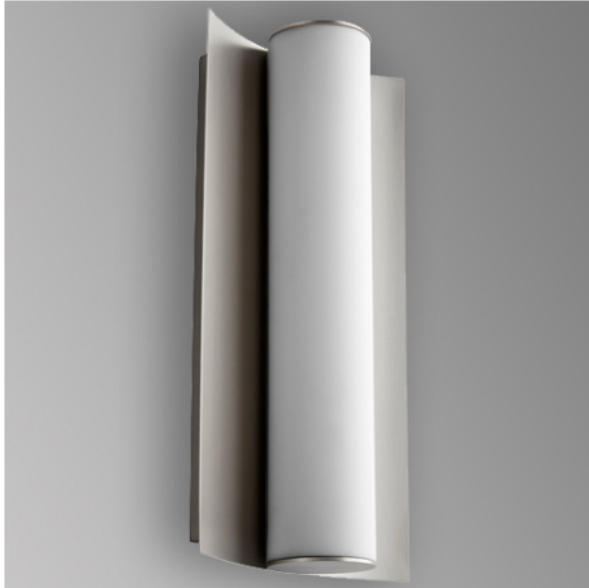
-24 Satin Nickel