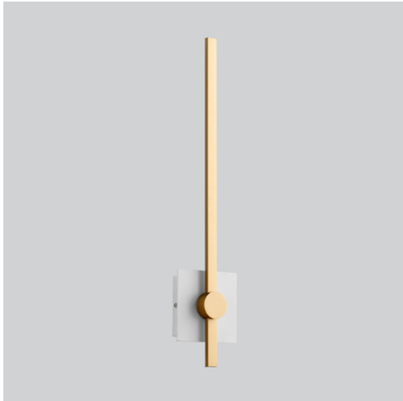
-650 White/Industrial Brass