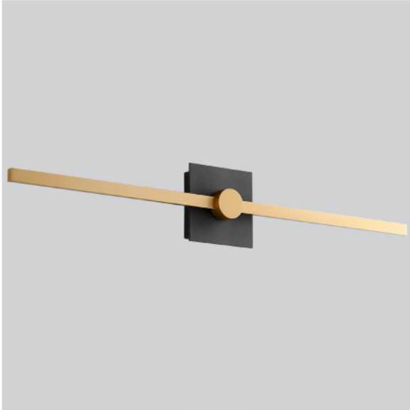
-1550 Black/Industrial Brass