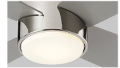
With optional light kit