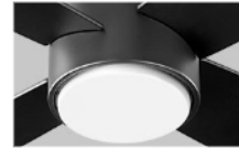
With optional light kit