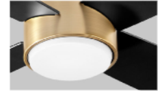
With optional light kit

SPECIFICATIONS 4 ABS Blades / 52" Blade Sweep / 14° Blade-Pitch 153x18 Motor 3 Speeds - Reversible 0.54A on high / 0.28A on low 64W on high / 16W on low 153 rpm on high / 74 rpm on low Wall control (Included) Remote Control 3-8-1000-0 (Optional - Not Included)