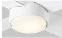
With optional light kit