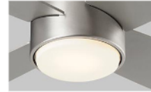
With optional light kit