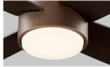
With optional light kit