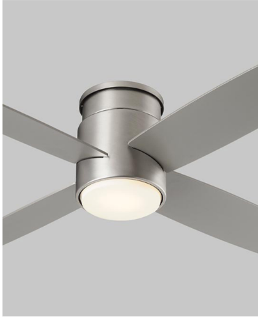
-24 Satin Nickel with Optional Light Kit