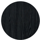
Fresno negro Black Ash